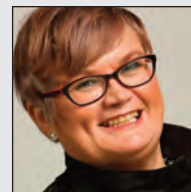
Carolyn Harris MP Shadow Home Affairs Minister & Swansea East MP